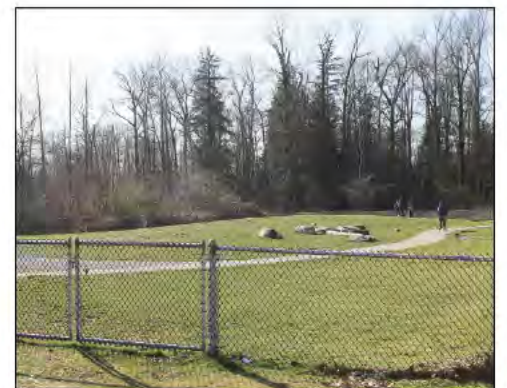
Off-Leash Barrier-Free Training Area

Improve boat launch to accommodate two trailers