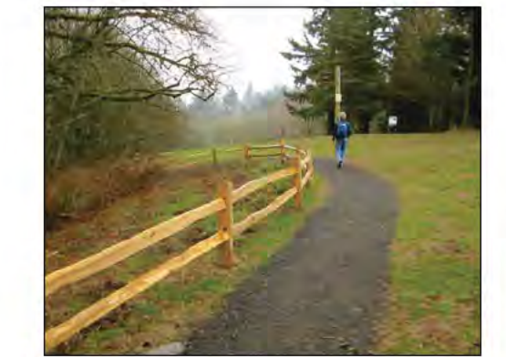
Typical Post and Rail Fence