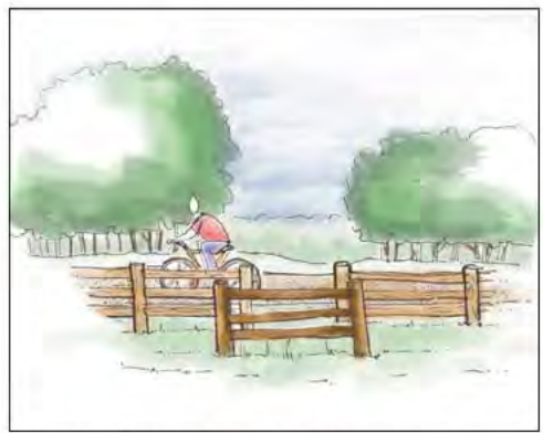
"Dogleg" Shared Use Path Intersections