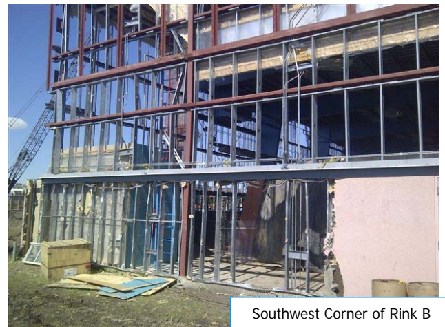
Southwest Corner of Rink B

Renewed arena spaces will be hardly recognizable when you visit Clareview again! We're excited and we hope you are too.