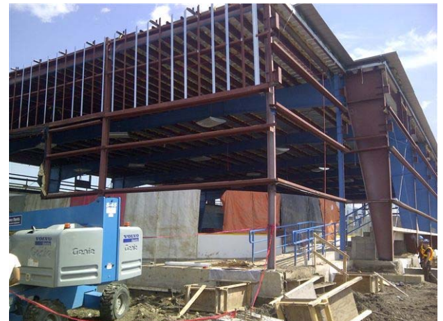
Top: Rink B looking Northwest Middle: New Arena Cladding Underway Bottom: Northwest Corner of Rink B