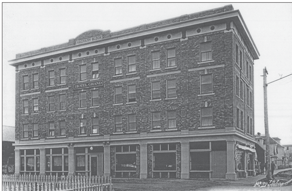
Hotel Grand/Hagmann Block c. 1914 10765-98 Street