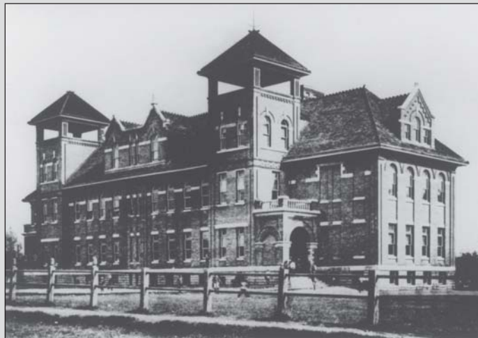
(Left) Queen Alexandra Elementary School c. 1910 7730-106 Street