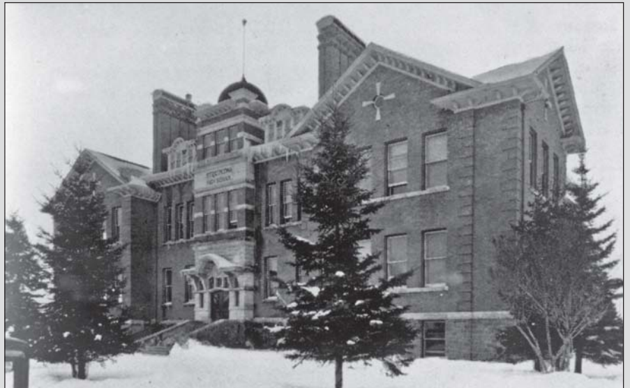
(Above) Old Scona Academic High School c. 1900 10523-84 Avenue