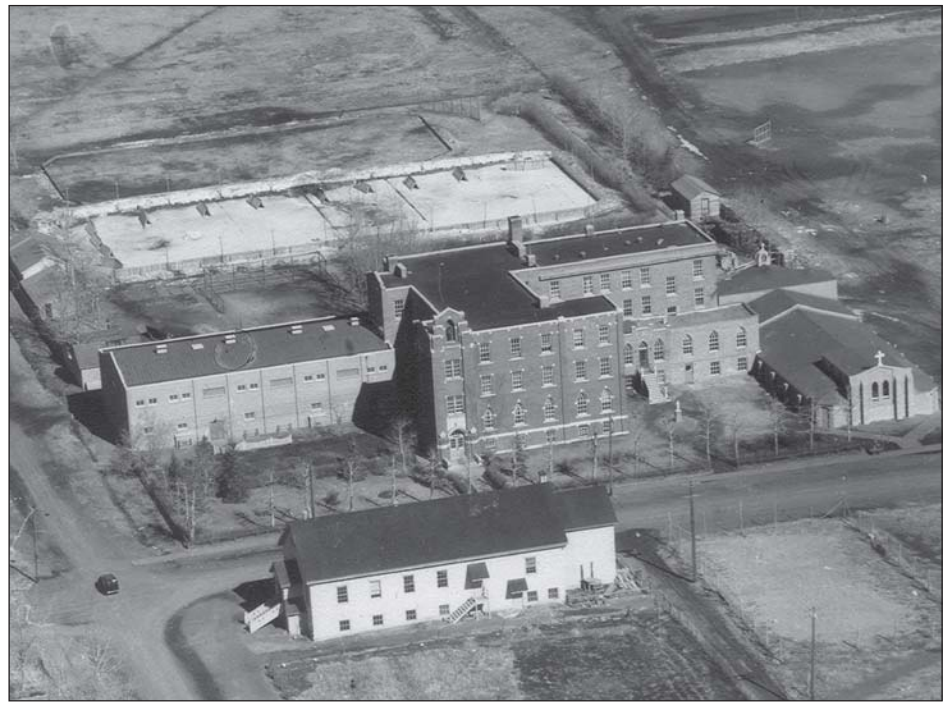
St. Francis of Assisi Friary/St. Anthony's College c. 1949 6770-129 Avenue

The current three-storey structure was built in 1925, with additions in 1932 and 1946. The red brick-clad concrete building was originally a modest facility. It grew over time following successful permission to open a Seraphic College for Franciscan Voca-