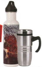
Custom Printed Drinkware