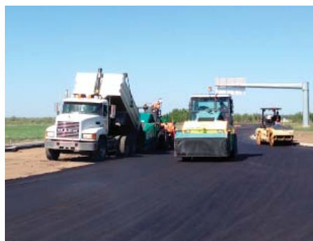
66 STREET (AHD TO 195 AVE)