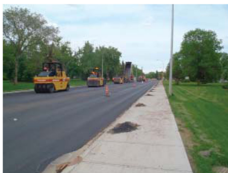
112 AVENUE REHABILITATION