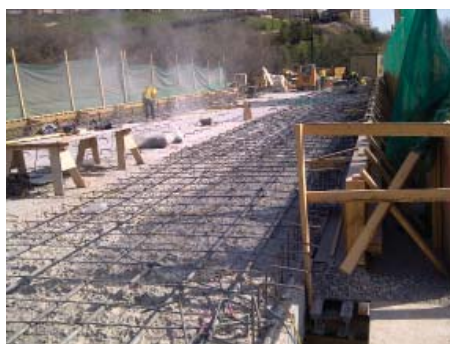
ROSSDALE ROAD BRIDGE