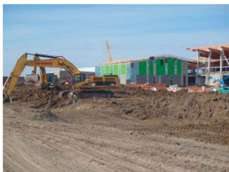
17 STREET GRADING