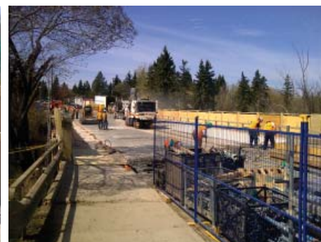
STONY PLAIN ROAD BRIDGE